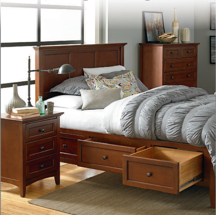
Shown here: 1316GAC Queen Storage Bed 1101GAC 3-Drawer Nightstand and 1180GAC 6-Drawer Chest shown in Glazed Antique Cherry finish.