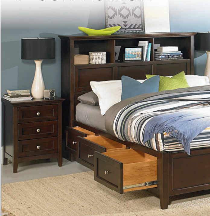
Shown here: 1370CAF Queen Bookcase Storage Bed and 1101GAC 3-Drawer Nightstand in Caffè finish.