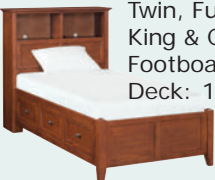
Twin, Full, Queen, King & Cal-King: Footboard: 19-1/2"H Deck: 17-3/4"H