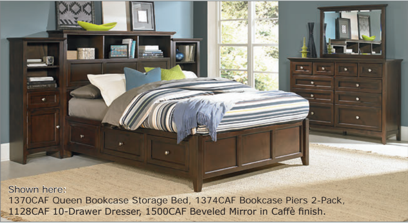
Shown here: 1370CAF Queen Bookcase Storage Bed, 1374CAF Bookcase Piers 2-Pack, 1128CAF 10-Drawer Dresser, 1500CAF Beveled Mirror in Caff  finish.