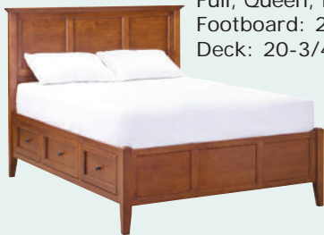
Full, Queen, King & Cal-King: Footboard: 22-1/2"H Deck: 20-3/4"H

All Full, Queen, King and Cal-King storage bed sizes have six spacious drawers. The #1300 Twin-SL bed has three spacious drawers that can be installed on the left or right. All drawers are equipped with maximum access, full extension metal ball bearing drawer slides.