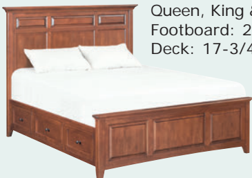
Queen, King & Cal-King: Footboard: 23"H Deck: 17-3/4"H