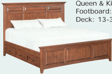
Queen & King: Footboard: 23"H Deck: 13-3/4"H

#2325 King Mantel Storage Bed for Adjustable Bases