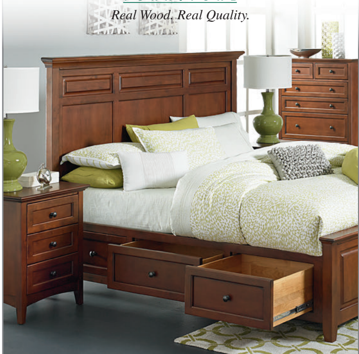
Shown here: 2319GAC King Mantel Storage Bed, 1101GAC 3-Drawer Nightstand and 1180 6-Drawer Chest in Glazed Antique Cherry finish.