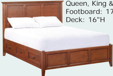
Queen, King & Cal-King: Footboard: 17-3/4"H Deck: 16"H