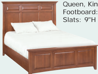
Queen, King & Cal-King: Footboard: 23"H Slats: 9"H